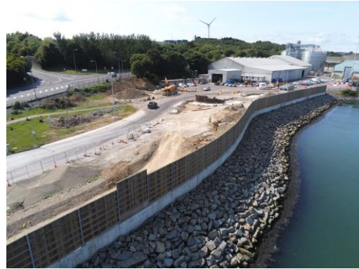
Current Works at Port Entrance