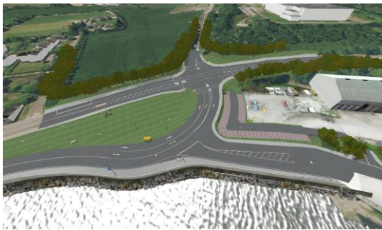
Port Entrance Final Layout

Construction is progressing well. Diversions are established within the Port property with internal traffic management in place for Port traffic. We do not anticipate working on the public road N28 until end of September 2018 when we will work on existing and future utilities. Our traffic management plan is being developed to minimise disruption to road users.