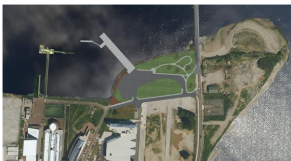
Paddy's Point Final Layout

No BAM construction traffic is permitted to pass through Ringaskiddy village. We have erected extensive signage directing our deliveries to our site. Further, all our suppliers have received written delivery instructions requiring them to enter site at the existing deep-water berth entrance. All deliveries to Paddy's Point travel through the Port and re-join the public road at the Ferry Terminal Entrance.