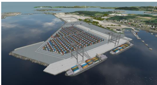
Container Terminal Final Layout

Dredging works at the berthing pocket adjacent to the new quay will commence on the 1 st September 2018. The loading and dumping of material at sea will be undertaken under the permits granted by the Environmental Protection Agency. We aim to complete the loading and dumping at sea works by end of October 2018. All loading and dumping at sea works will be undertaken from the marine plant and will not result in any additional road traffic in the period. Subject to prevailing weather conditions the loading and dumping at sea works will be undertaken continuously throughout the period.